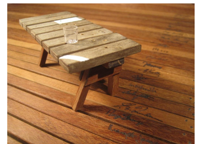
completed 1.5" = 1' scale model