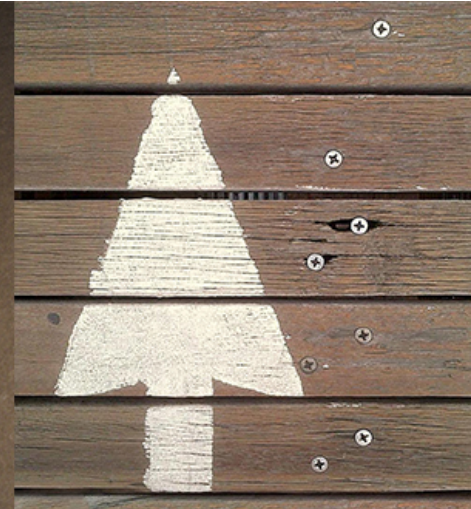
a study model of a table made from one boardwalk plank of the Brooklyn Bridge